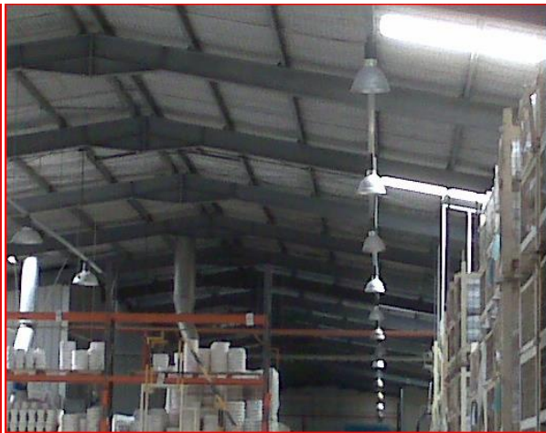
Project : The Royal Doulton Volume : 30.000m 2 City : Balaraja, Banten