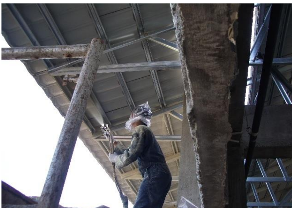
Project : Styrofoam Factory Volume: 1100m 2 City : Tangerang