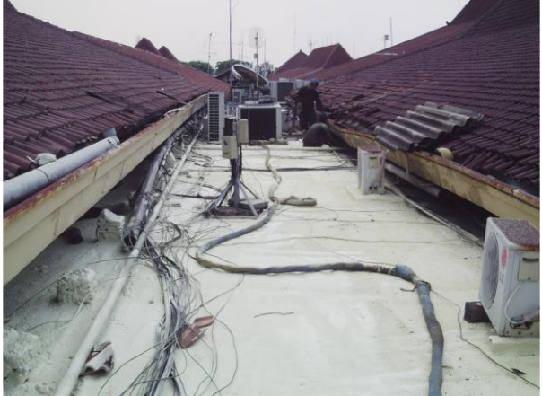
Project : International Airport Semarang Volume : 900m 2 City : Semarang