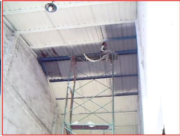
Project : PT. Indoyoke Volume : 1279m 2 City : Margomulyo, Surabaya