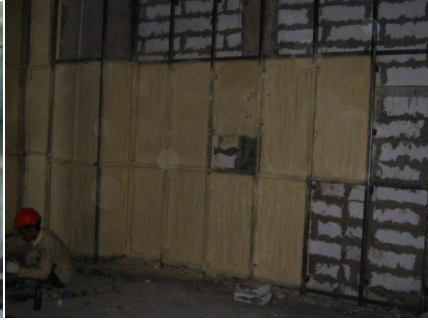
Project : The Square Ballroom, ICBC Building Volume : 2215m 2 City : Surabaya