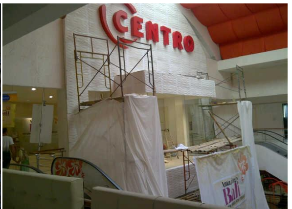
Project : Centro Dept Store, Kuta Bali Volume : 350pcs of Moulded PU City : Bali