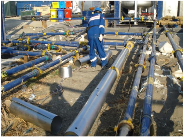
Project : Gas Pipe Distribution Exxon Cepu Volume: 60km City : Cepu, Jawa Tengah