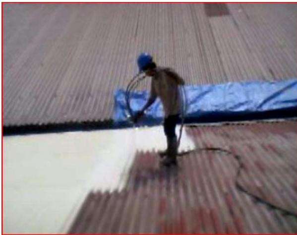
Project : PT. Nutricia Volume: 7.000m 2 City : Jakarta