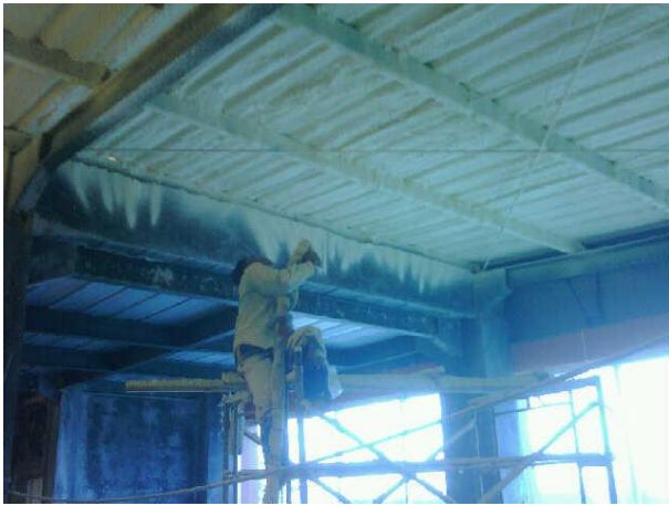
Project : The Radiant Volume : 300m 2 City : Rempoa, Jakarta