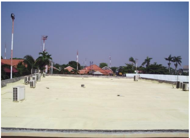
Project : International Airport Semarang Volume : 900m 2 City : Semarang