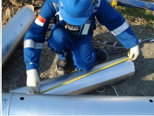
Project : Gas Pipe Distribution Exxon Cepu Volume: 60 km City : Cepu, Jawa Tengah