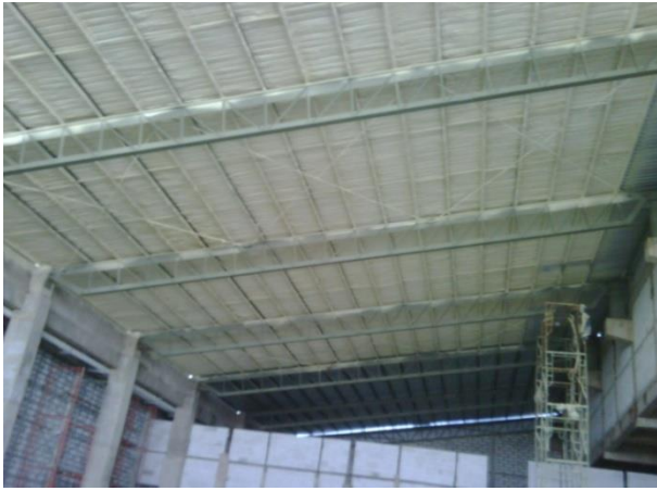
Project : The Square Ballroom, ICBC Building Volume : 3000m 2 City : Surabaya